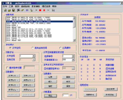
Software interface (C++)