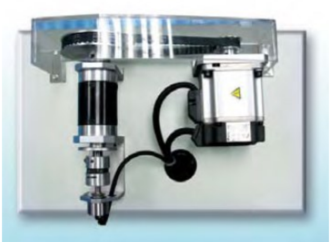
Note: The outlook of the product might be different