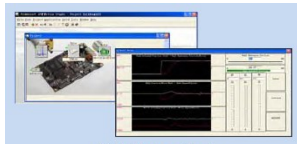
IPM Motion Studio